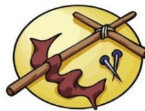
The Road to the Cross

A tradition that goes back to the Middle Ages. European pilgrims would travel to the Holy Land to walk the same steps as Jesus did in his final hours. The idea of having stations to represent each part of Jesus' journey came into practice for those who could not travel to the Holy Land themselves.